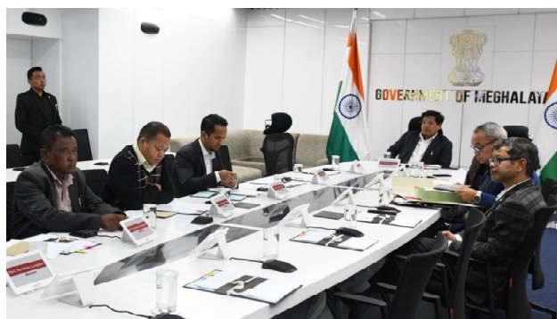
Agency Shillong, Nov 23:

A delegation of Meghalaya ministers led by CM Conrad K Sangma will meet Union Home Minister Amit Shah on November 24 to demand a CBI or NIA probe into the violence that left six people dead on the state's border with Assam.