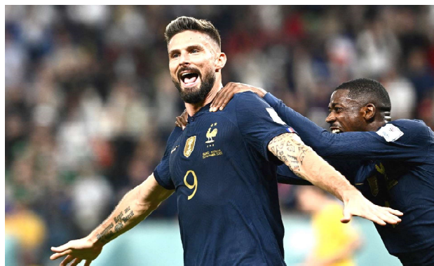
Olivier Giroud scored a brace as France made a winning start to their World Cup title defence.

Les Bleus are the first defending champions to win their opening match since Brazil in 2006, which has already put them in a good position to ad-