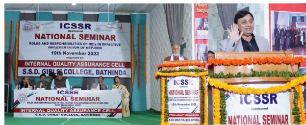
IT Correspondent Bathinda (Punjab), 23:

S.S.D. Girls' College, Bathinda organized an ICSSR sponsored one day National Seminar on 19th November, 2022 on topic "Roles and Responsibilities of HEIs in the effective implementation of NEP-2020" under the theme of "Adazi ka Amrit Mahaotsav".